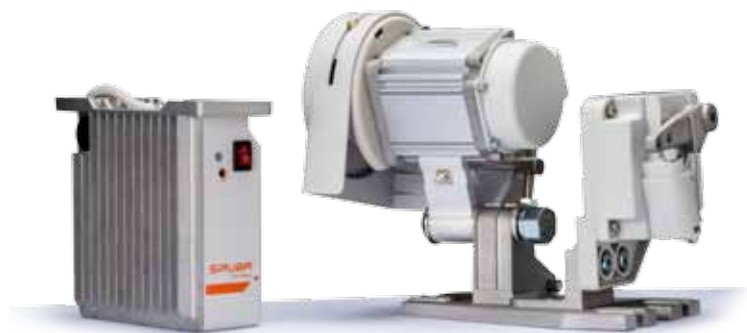
TSA伺服马达为选配 TSA Servo Motor is optional.